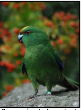
Orange-fronted parakeet / kākāriki karaka.

In the last three years the Trust has successfully raised for release 66 birds into Lake Sumner Forest Park, with the support of DOC, Ngāi Tahu for whom kākāriki karaka is a taonga species, and Christchurch Helicopters.