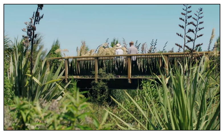
Walkways provide public access to riparian conservation.

Replacing plant pest species with native riparian planting is ongoing exercise along the Ōtukaikino waterways. The Trust's work has included fencing off riparian margins from stock, with some 60,000 natives planted to date; and creating streamside walking tracks for public access along the eastern boundary adjacent to Clearwater Golf Resort. Land clearance along this corridor has occurred in partnership with Environment Canterbury, Christchurch City Council, the New Zealand Fish & Game Council, and the Department of Corrections.