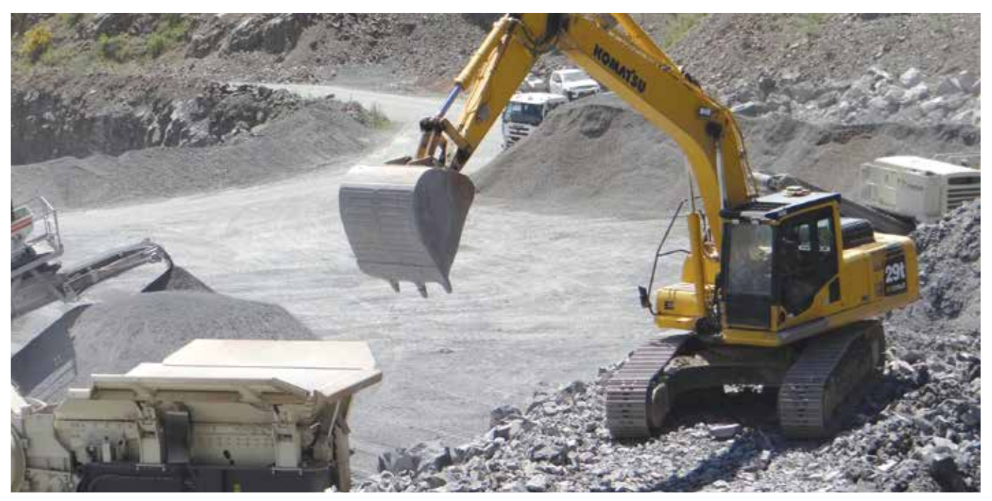
Quality assurance from quarry to pavement was one key finding of the Crossen report.